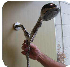
Hand Held Showers